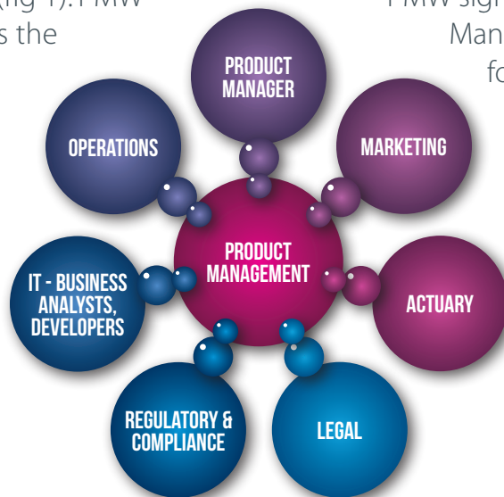
fig 1. PLM Interested Parties

PMW significantly benefits the Product Management Community and its formal approach to describe the product ensures that it can be consumed by IT.